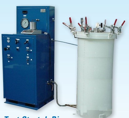
Test Stretch Rig

High Pressure Valves and system accessories To assist in the controlled use of pressure and flow.